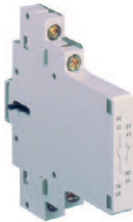
Auxiliary contact blocks for side mounting (3.5A/230VAC; 2A/400V AC)