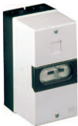
Insulated Enclosure IP55 with integrated PE(N) terminal; top and bottom each have 2 metric knock-outs