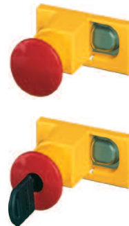
Emergency-Stop twist or key to release, red on yellow background