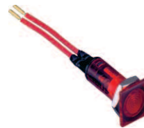
Indicator Light with neon bulb, nominal rated voltage: 220 - 240V or 380 - 440V