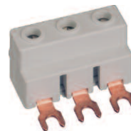
Power Feed Block