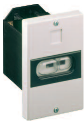
Flush Mounting Enclosure IP55 with integrated PE(N) terminal