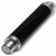
6 / 12KV